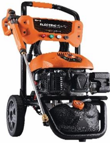
Recalled 3125 CON GAS PW ES SPEEDWASH CARB EPA3 Pressure Washer