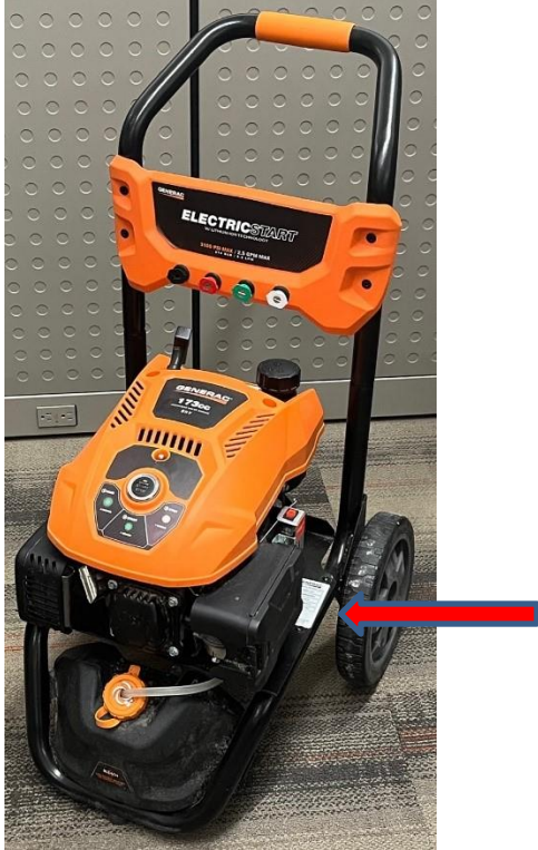
Recalled Generac Electric Start Pressure Washers label location