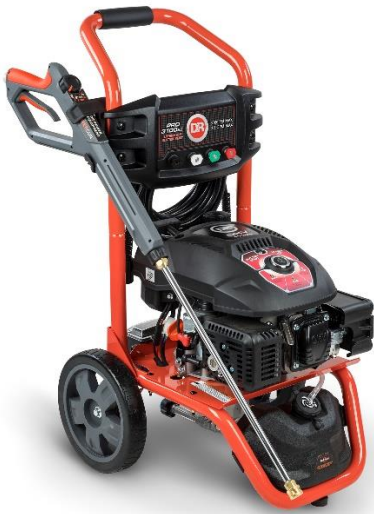
Recalled DR Pressure Washer PRO 3100