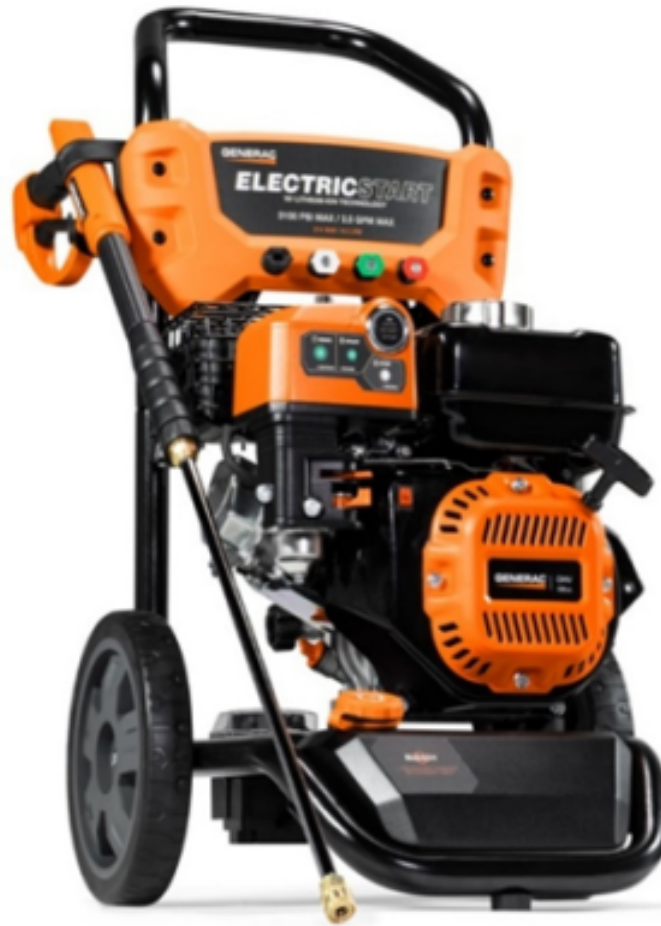
Recalled Generac Model G0089111