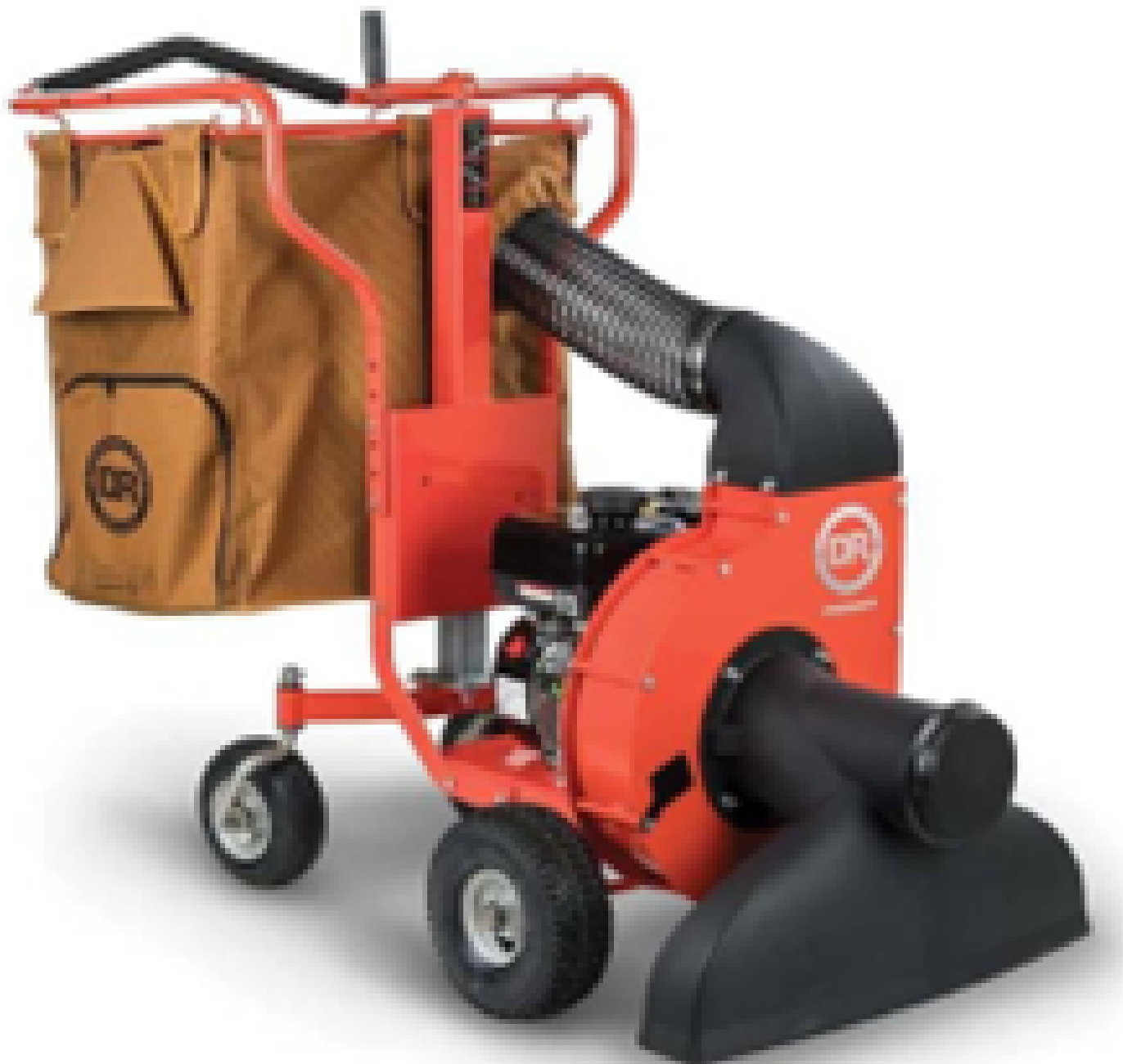
Recalled DR Power Equipment walk-behind leaf vacuum